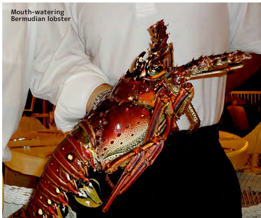
Mouth-watering Bermudian lobster

RIGHT The fine scents of Lilly Perfumery