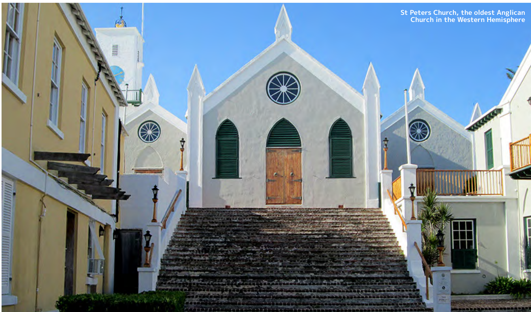
St Peters Church, the oldest Anglican Church in the Western Hemisphere

Bermuda is truly a utopia. From culture and nightlife to the beach scene and outstanding hospitality, this is a small island with a big heart, and is not to be missed at any time of year. You will leave with one thought in mind -- when can you get back for another visit?