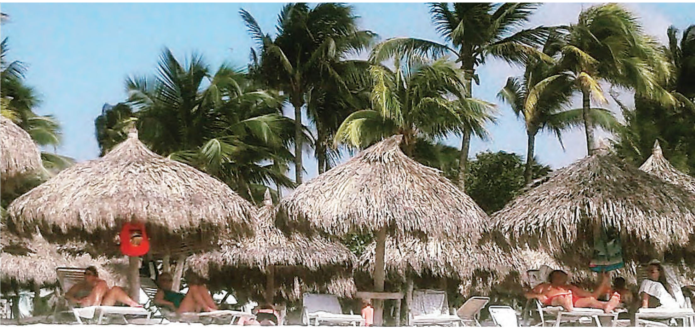
Hanging out under a palapa. PHOTO: TIFFANY THORNTON/TELEGRAPH-JOURNAL

A waterproof read to take to the beach. PHOTO: TIFFANY THORNTON/TELEGRAPH-JOURNAL