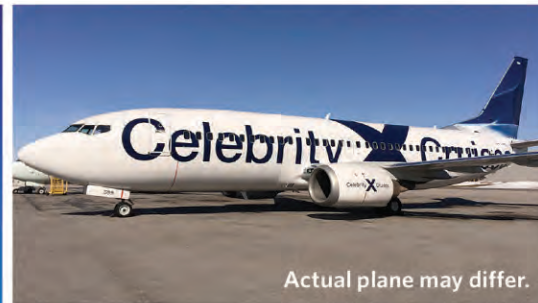
Actual plane may differ.

From our previous guests: "Amazing holiday...modern luxury from start to finish." "So easy and stress-free to fly from our local airport!"