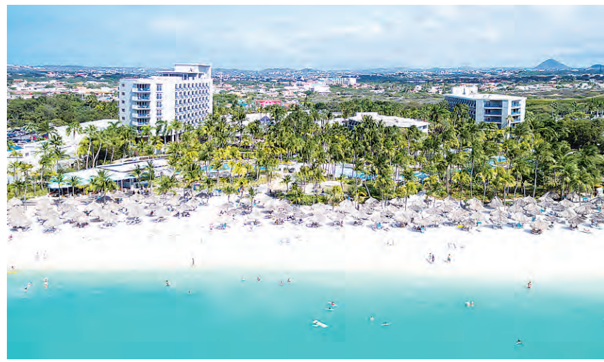
Aruba offers crystal blue waters and pristine beaches.