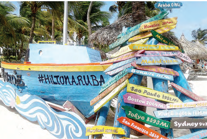
Colourful island life shines on the boat display.