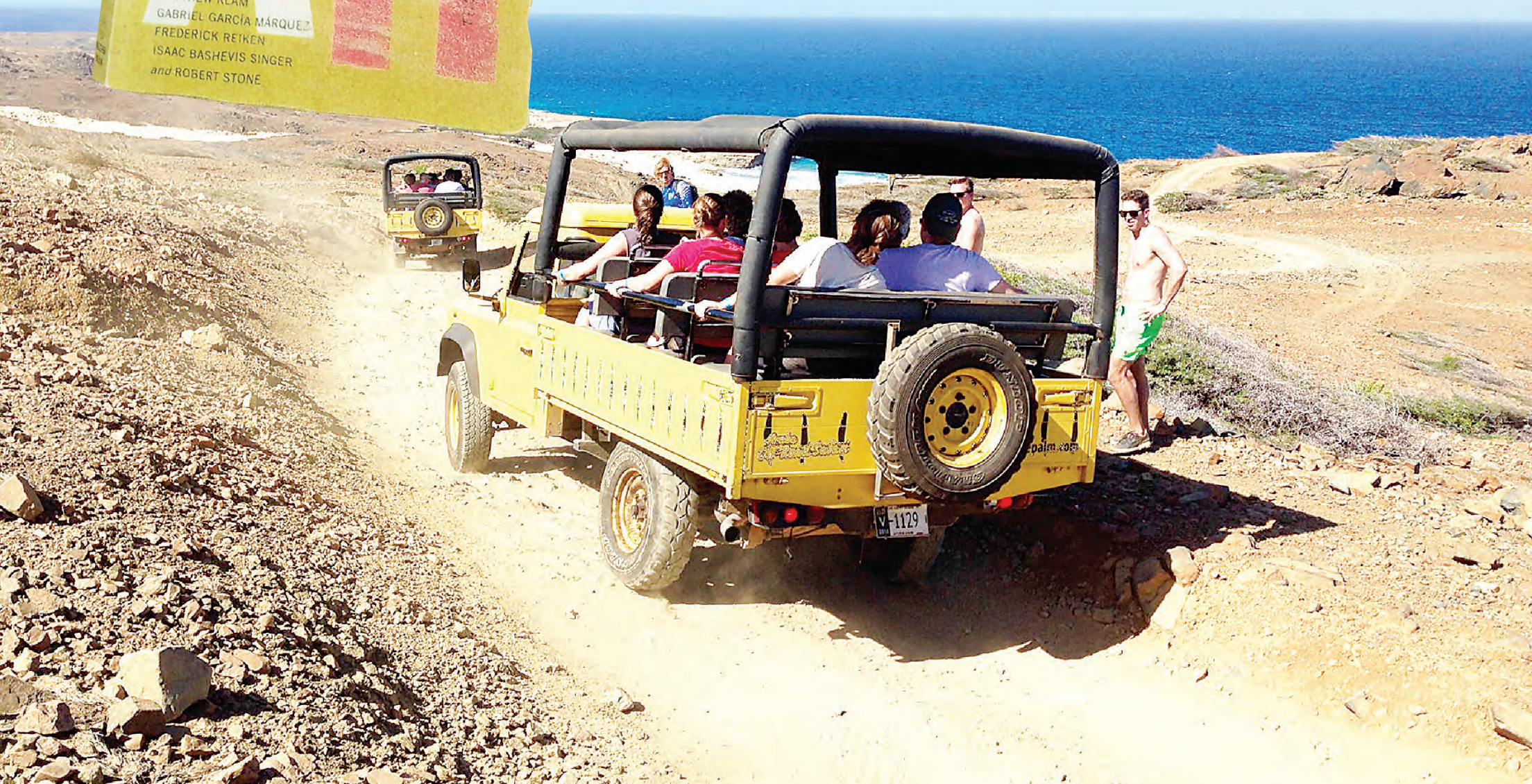
Venturing into the Aruban outback.