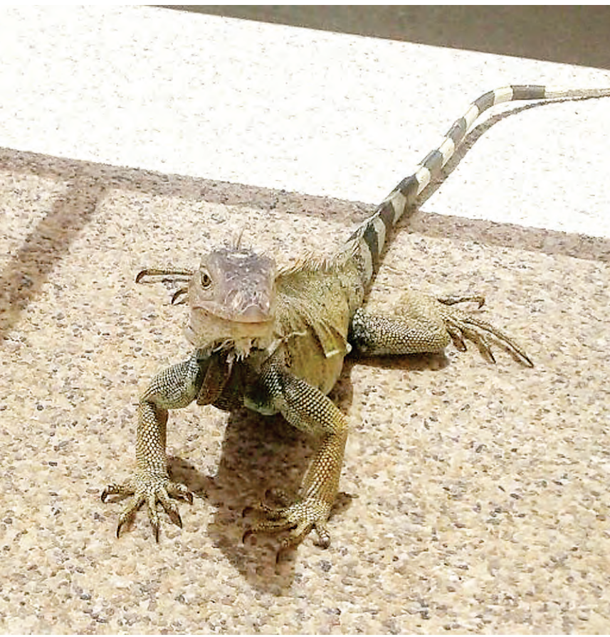
A smiling iguana on One Happy Island.