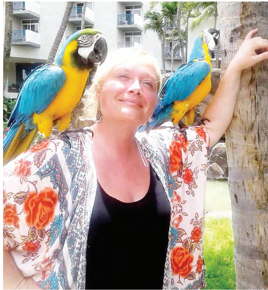
Hanging out with the birds at Hilton Aruba.