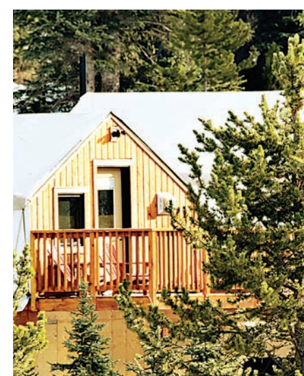
Rustic glamping at Mt. Engadine