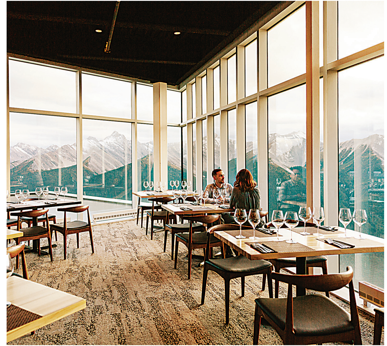
Inside Sky Bistro