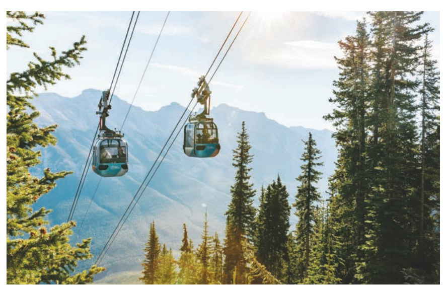
The historic Banff Gondola