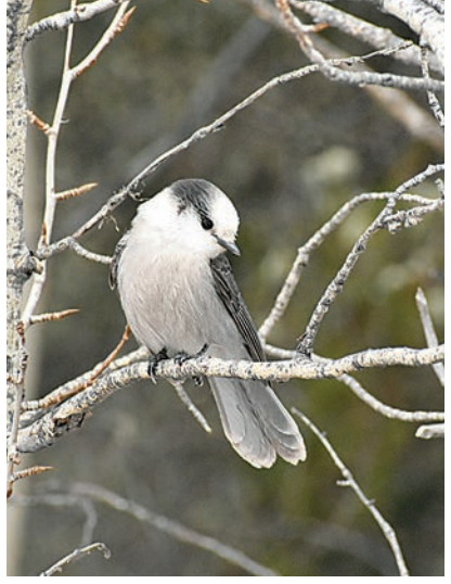
A grey jay makes its home in the forest.