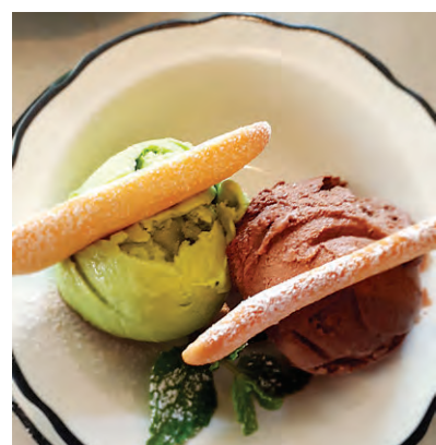
Homemade gelato from Monello.