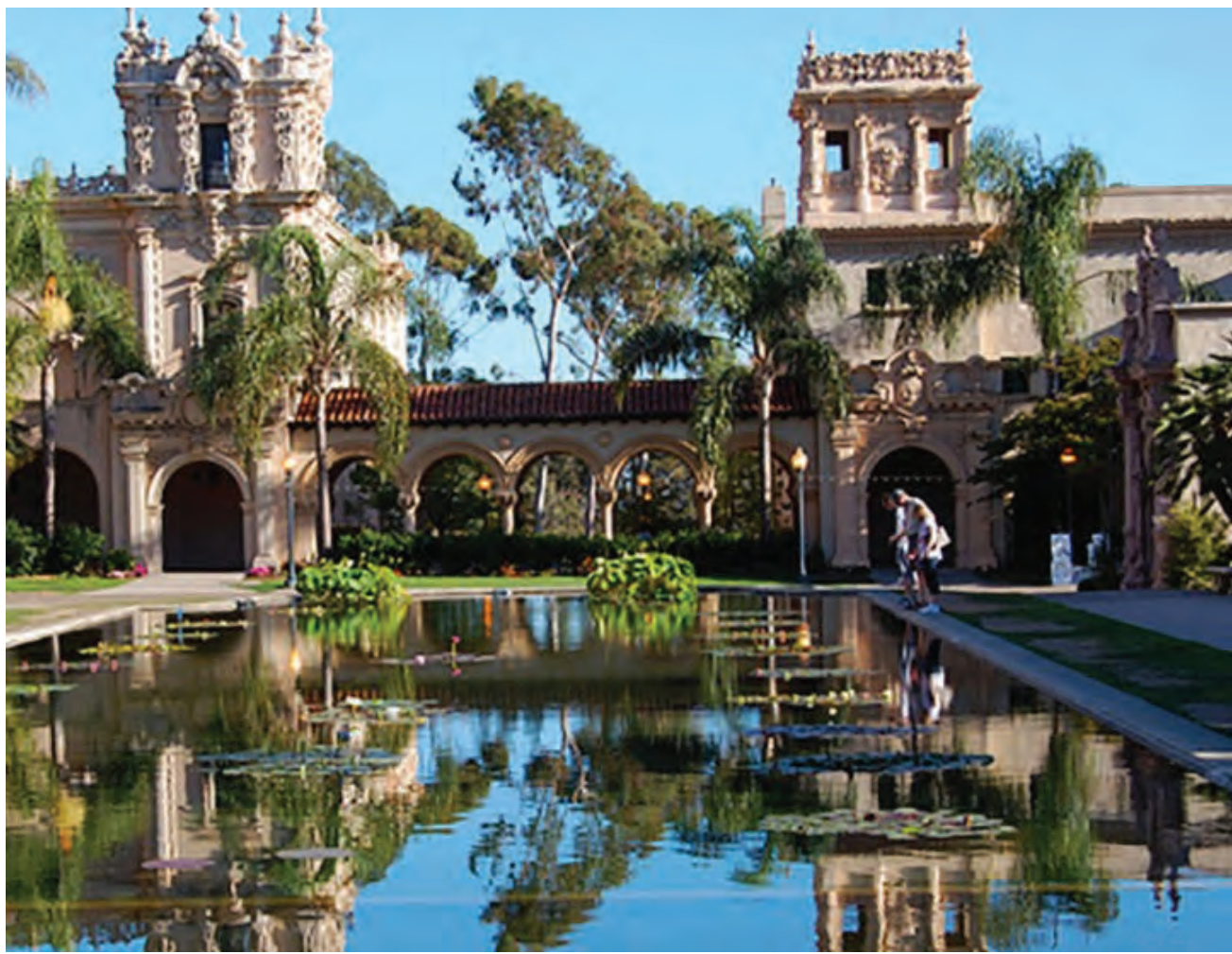
Beautiful Balboa Park. PHOTO: TIFFANY THORNTON/FOR THE TELEGRAPH-JOURNAL

PHOTO: TIFFANY THORNTON/FOR THE TELEGRAPH-JOURNAL