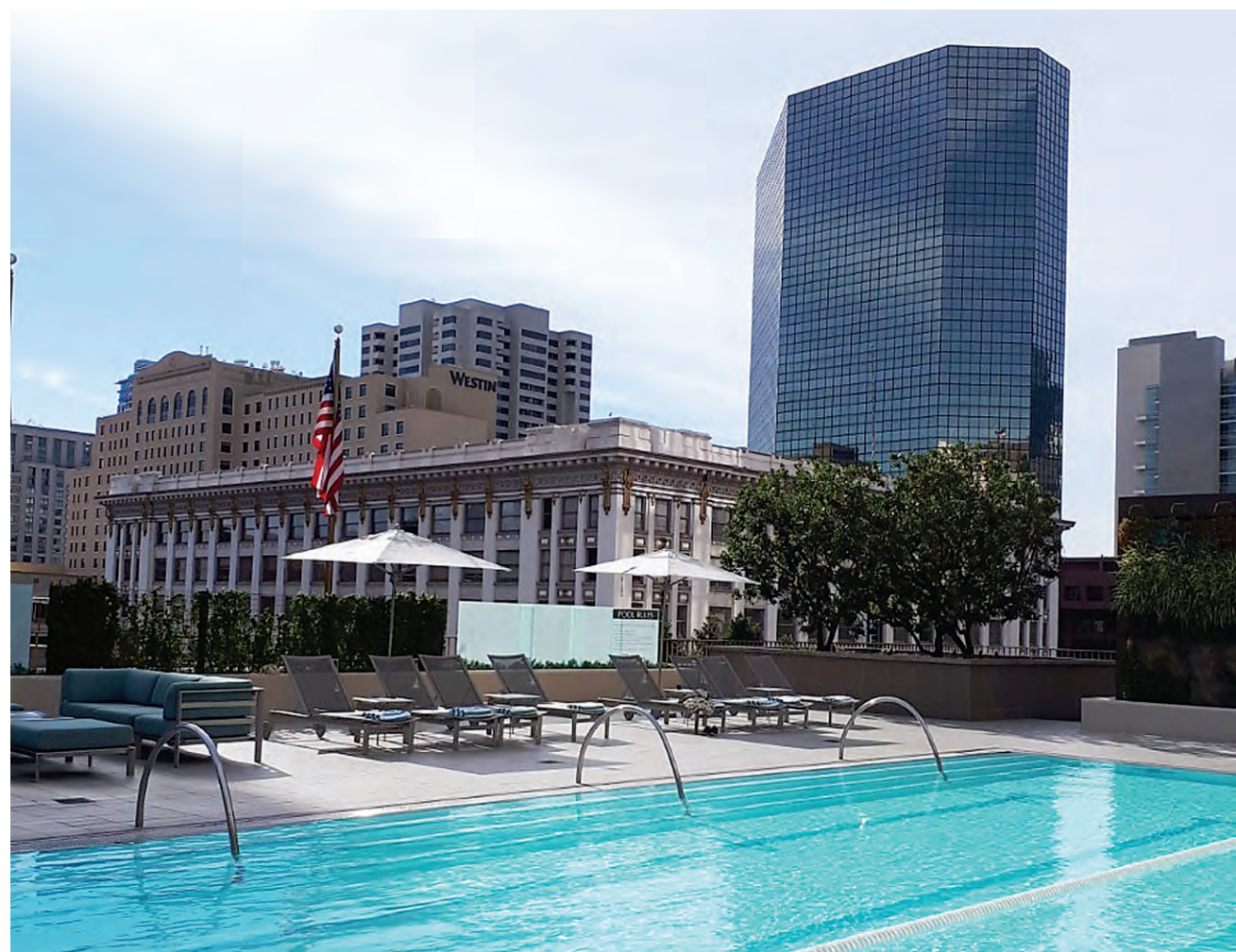
The outdoor heated pool at The Westgate hotel.