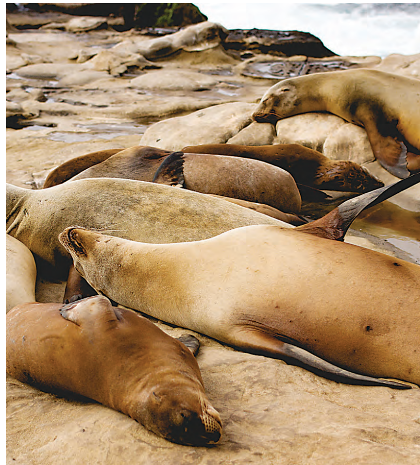
Sea lions lounging on La Jolla beach.