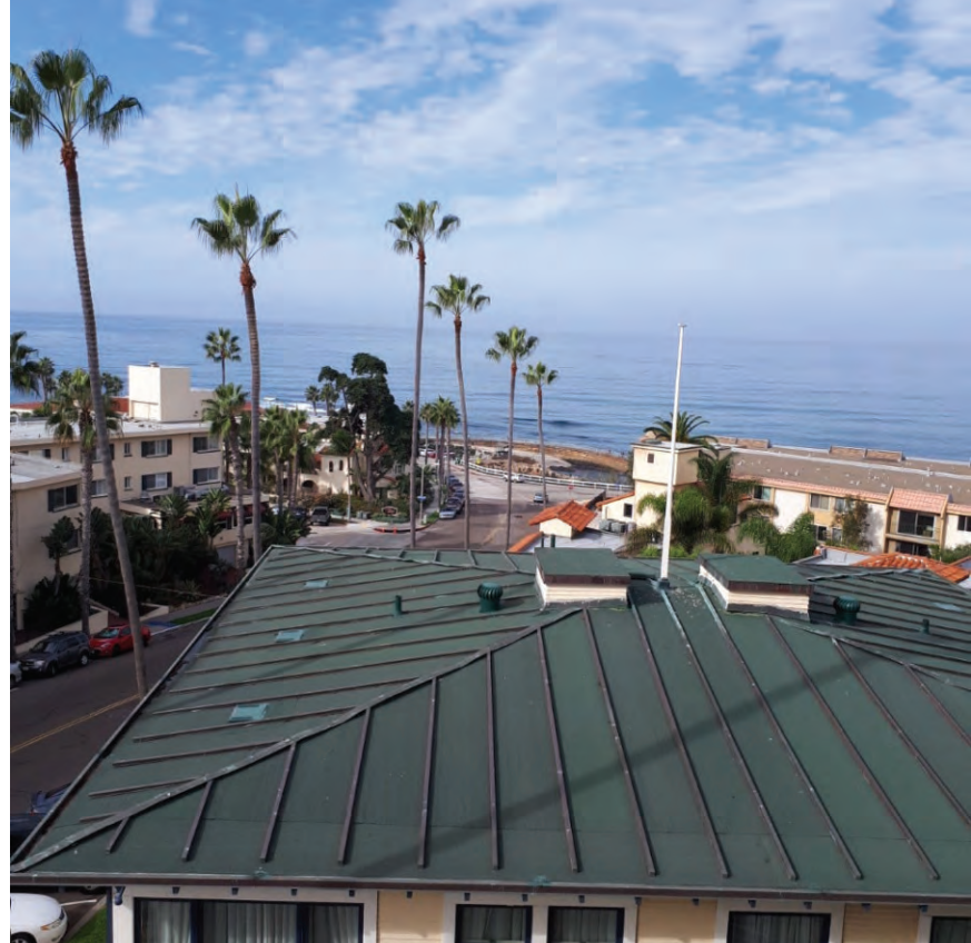
An ocean view from one of the suites at the Grande Colonial hotel La Jolla.