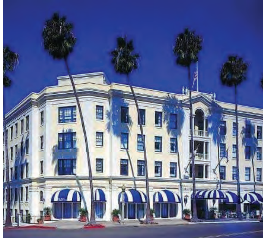
A view of the historic Grande Colonial Hotel.