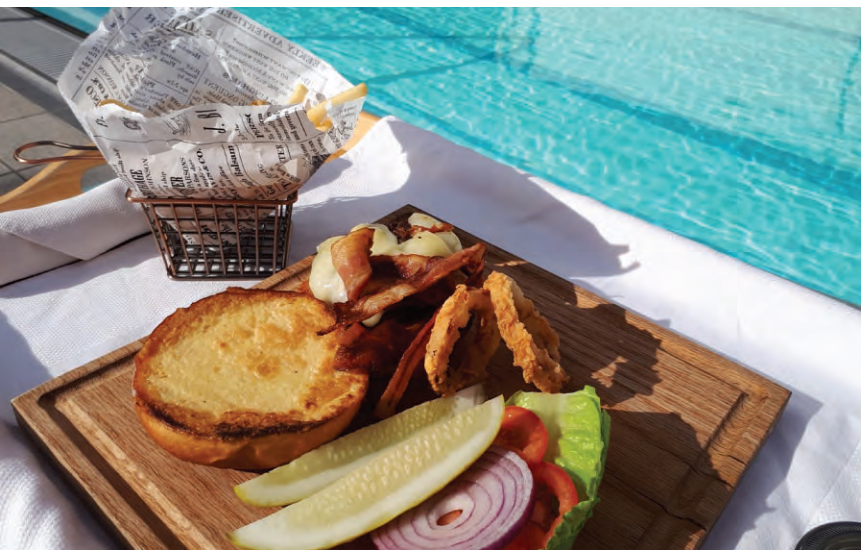
Indulging in the Kobe burger poolside at the Westgate Hotel.