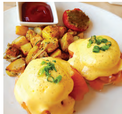
Yummy Eggs Benedict and smoked salmon at The Grande Colonial hotel.