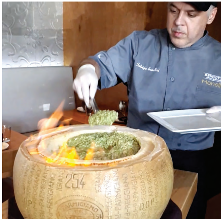
Risotto served up in a cheese wheel at Monello.