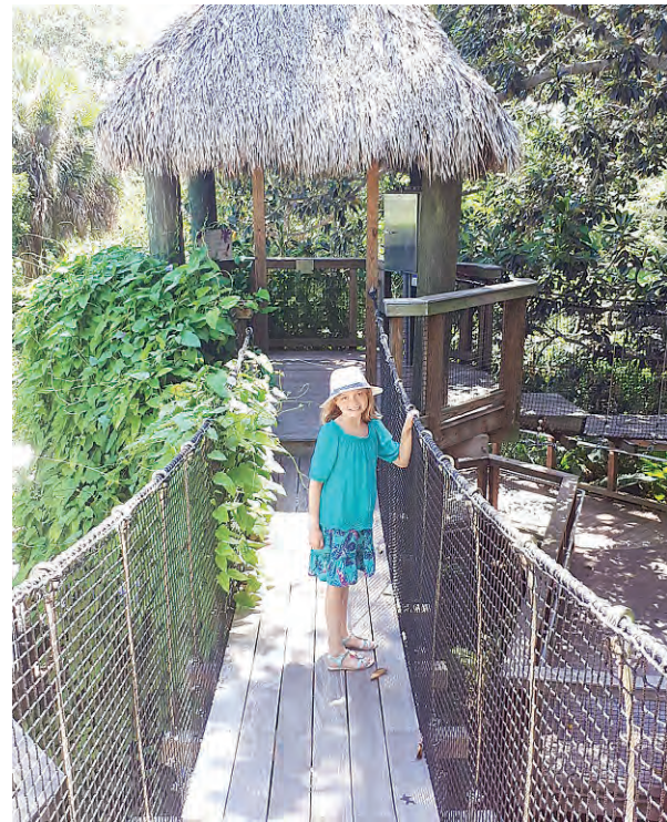
The kids canopy village bridge at the Marie Selby gardens