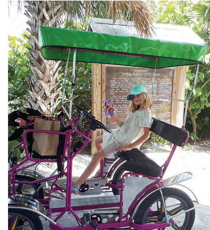
Anna Maria Island's Beach Bums bike rental