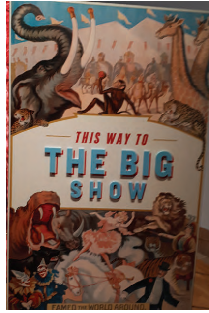
A Ringling Circus vintage sign for The Big Show