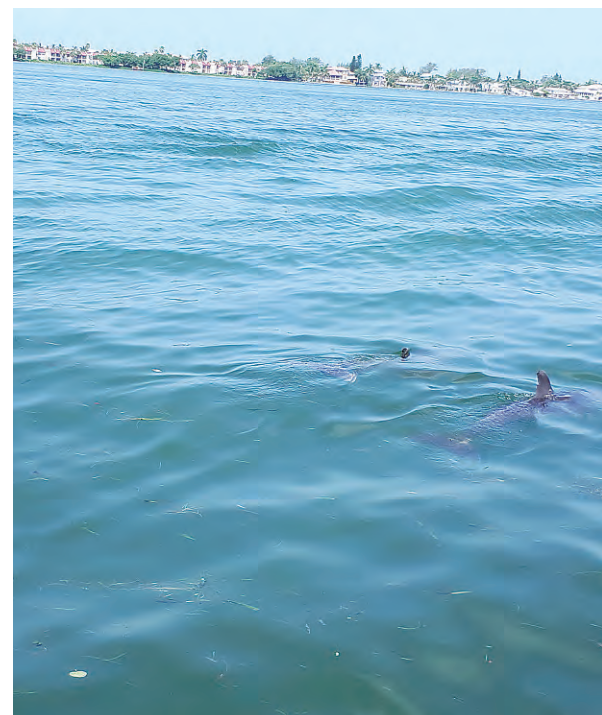
The dolphin tour on Anna Maria Island