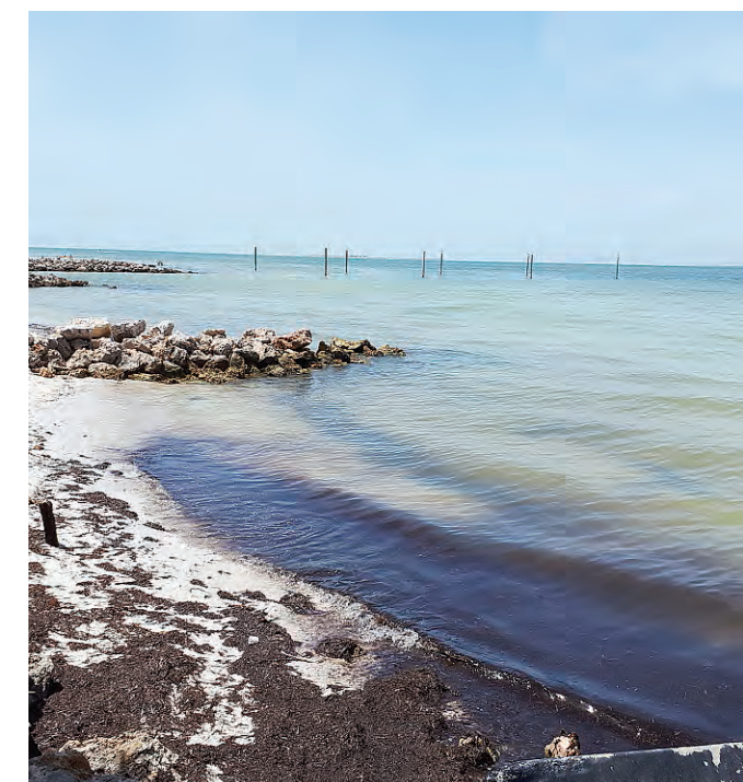
Anna Maria Island is a tropical oasis on the Gulf of Mexico.