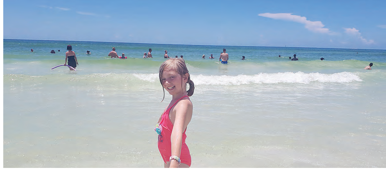
Siesta Key Beach