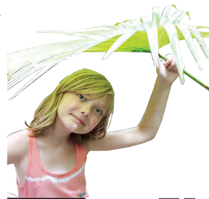
A break from the heat at Jungle Gardens