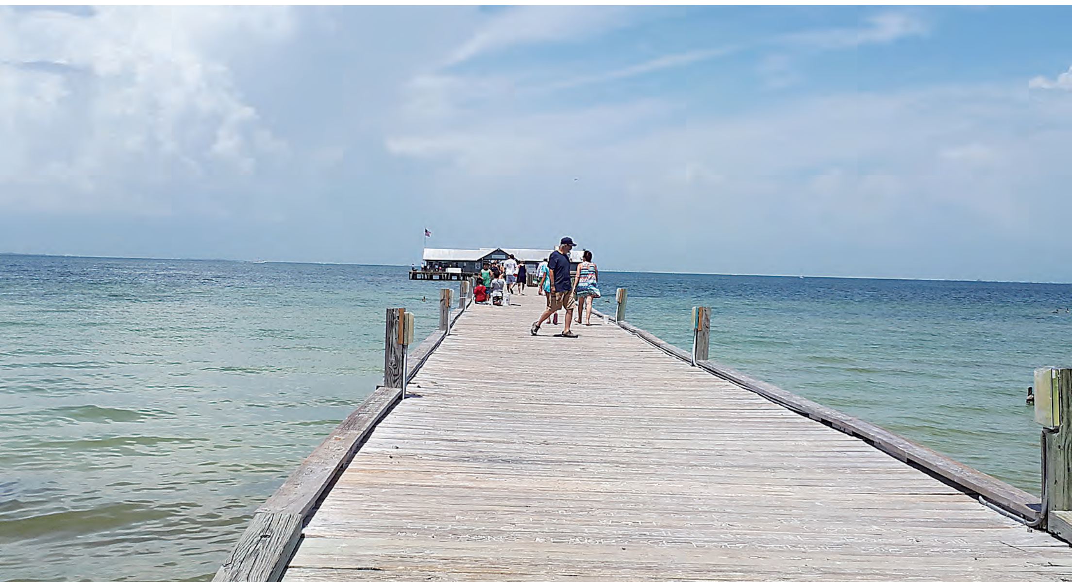
The pier on Anna Maria Island