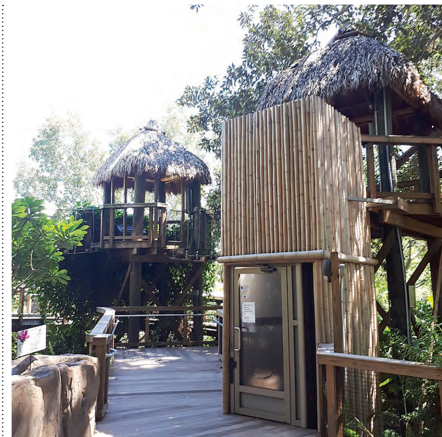
The kids canopy village at the Marie Selby gardens