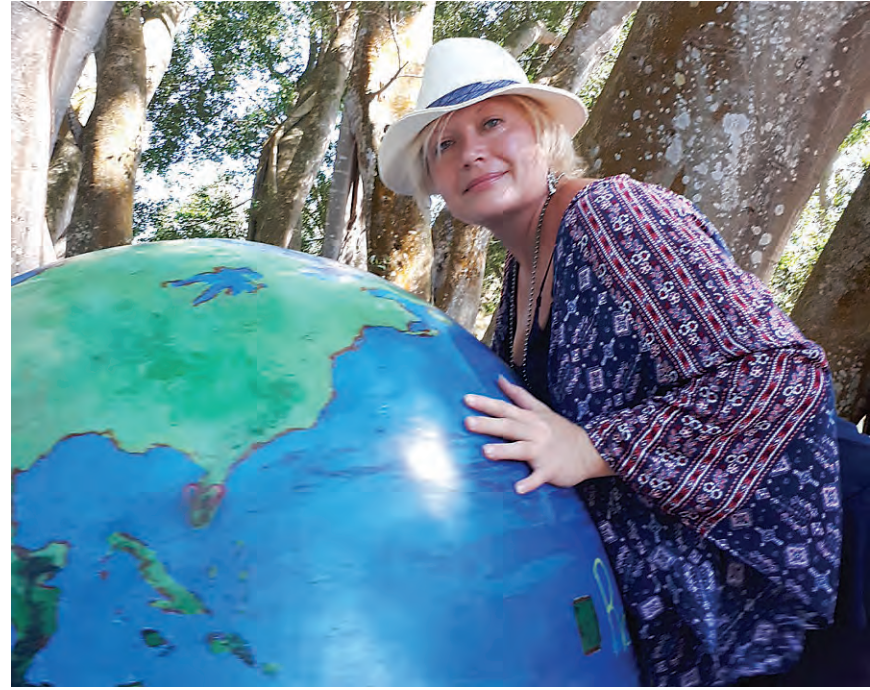
A globe at the Marie Selby gardens