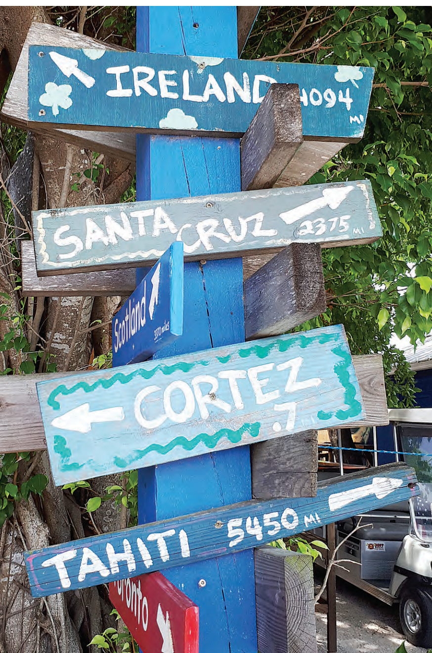
Signs on Anna Maria Island